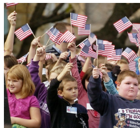
A group of elementary school children at the Veterans' Day ceremony on the courthouse square proudly wave their American flags—courtesy of the Exchange Club of Charleston!