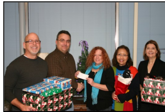
Christmas donation to Project HOPE